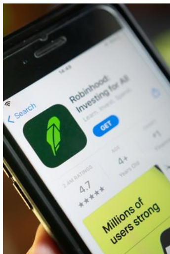
An iPhone user downloading Robinhood App, a stock trading app, from the App Store.

South Florida litigators hit financial services provider Robinhood Markets Inc. with a consolidated class action complaint Tuesday in Miami federal court—less than two days before the company seeks a valuation of upwards of $35 billion in an initial public offering.