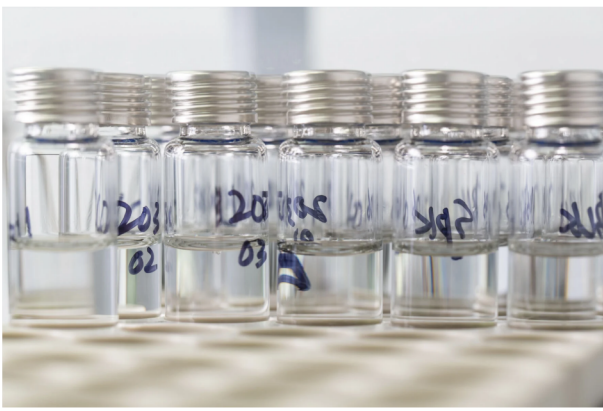
Samples are prepared for water quality testing. On March 3, testing of the Temple Terrace's water revealed a high level of PFAS, which has linked to cancers and a host of other health issues.

By JOHN C. COTEY, Tampa Beacon Jul 28, 2025 Updated Aug 1, 2025